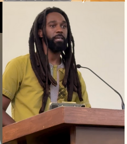
Click here to hear from our Executive Director!