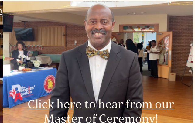
Click here to hear from our Master of Ceremony!