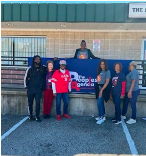
Some of the EJC Staff at The Voter Cook Out - Triangle Plaza (Athens, GA).

This year, the dedicated EJC team has invested considerable effort in registering Georgia citizens across our 13 counties. Collectively, we've successfully registered over 1,100 voters in this calendar year alone. Our commitment extended beyond voter registration; we actively engaged in GOTV (Get Out To Vote) initiatives. A heartfelt salute goes to our exceptional coordinators and canvassers for their tireless dedication and unwavering commitment. Their hard work has been instrumental in advancing our mission and empowering our community through civic participation.